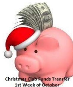
Christmas Club Funds Transfer 1st Week of October

Using any other address, will cause a delay in items being credited to your account. Please let us know if you have any questions or concerns.