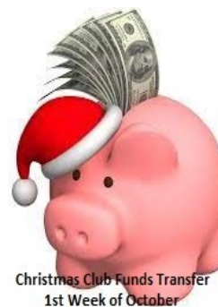
Christmas Club Funds Transfer 1st Week of October

Using any other address, will cause a delay in items being credited to your account. Please let us know if you have any questions or concerns.