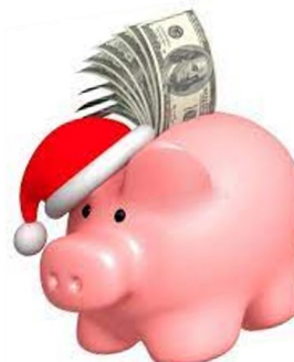
Christmas Club funds transfer the 1st week of October

To help with holiday expenses and taxes, eligible Credit Union members may be able to skip the December payment on their loans. To be eligible, a loan must have been opened prior to June 1, 2023, had a full payment made within 45 days and there may be no more than two 30-day delinquencies. Any loan that has been refinanced is considered a new loan and is subject to the above guidelines. If you are interested in the skip-a-pay option, please talk to a member service representative. Forms are included with this mailing and will also be available by calling the office.